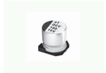
Marking color: Blue